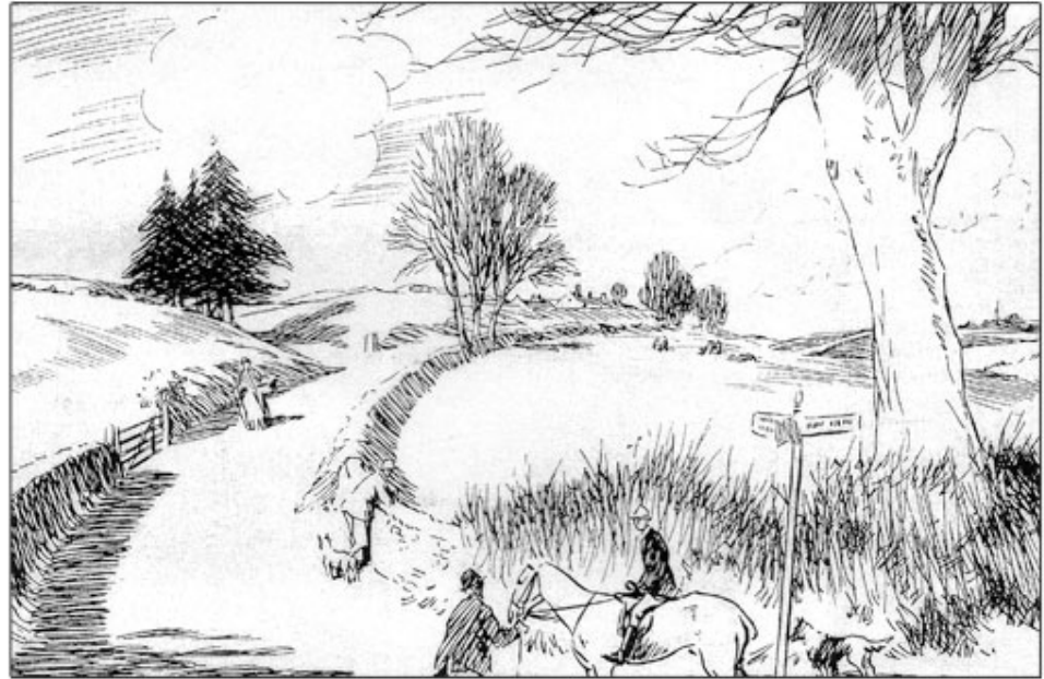
BY THE WIDENING OF LANES AND THE REMOVAL OF SLOPES, AWKWARD CORNERS AND HEDGES -