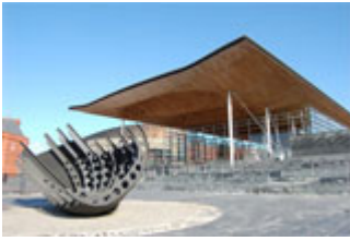
The PAW website will be relaunched at the PAW Annual General Meeting, which will be held in the Senedd on 14 th July